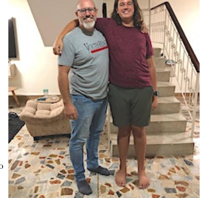
As you can see, these are big guys... I barely come up to their shoulders.