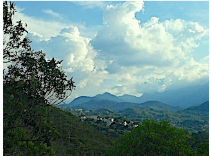
The view from the mountain