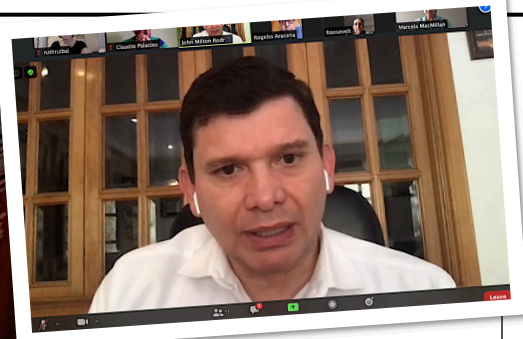
Our Christian senator