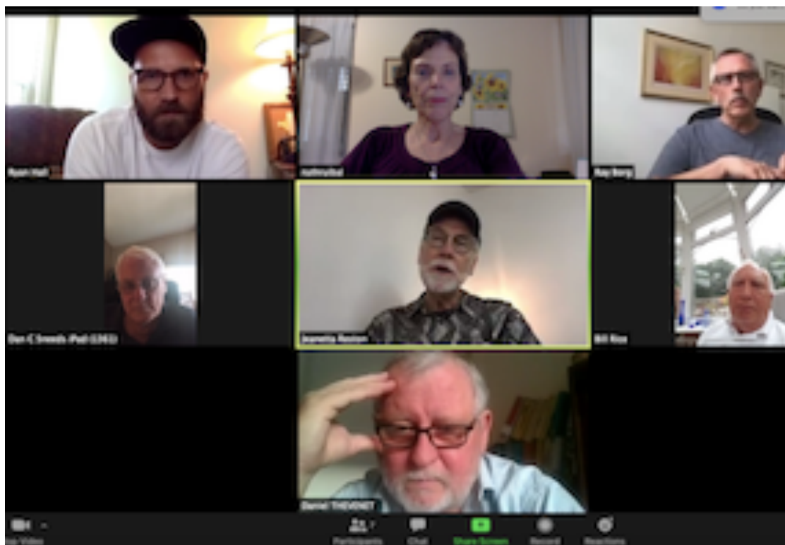
Monthly zoom meeting of the International Advisory Board for Messenger Fellowship